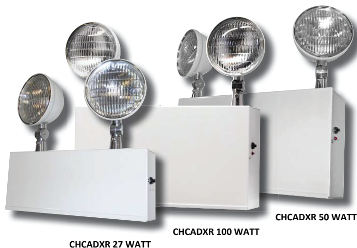
CHCADXR 27 WATT

PROJECT: _____ FIXTURE TYPE: _____ LOCATION: _____ CONTACT/PHONE: _____